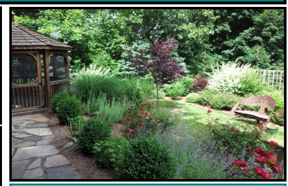
Línda's Healíng Garden created through generous donations to the Linda Young Ovarian Cancer Support Program

If you have these symptoms almost daily for more than two weeks or have symptoms that are unusual for your body, see your gynecologist. Experts recommend a pelvic/rectal exam, a CA-125 blood test and a transvaginal ultrasound. If ovarian cancer is suspected, seek out a gynecologic oncologist. Go to: foundationforwomenscancer.org